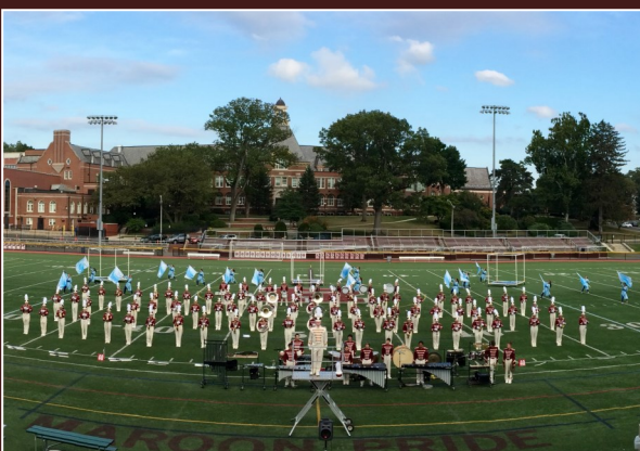
The Ridgewood High School Marching Band practices on the football field.